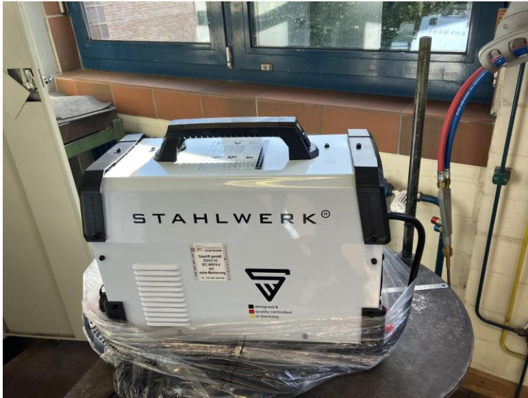
New welding machines