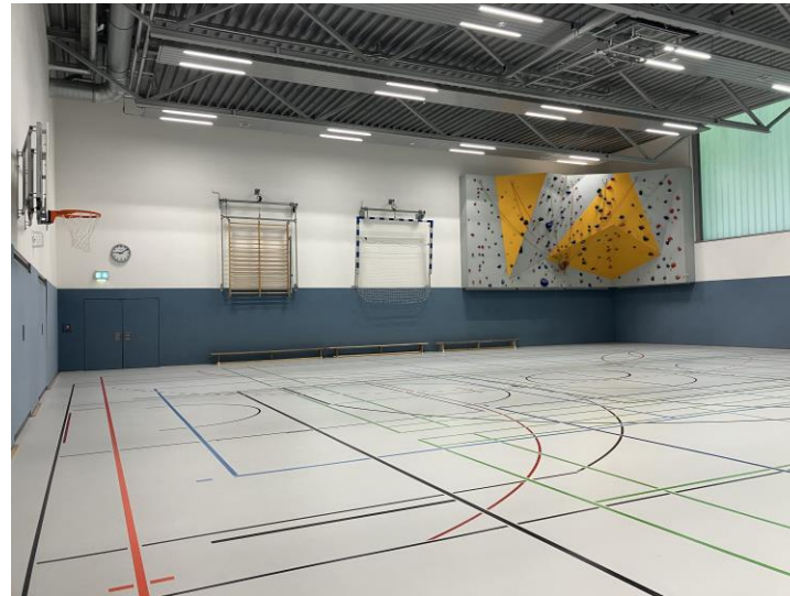
Sports center at the school