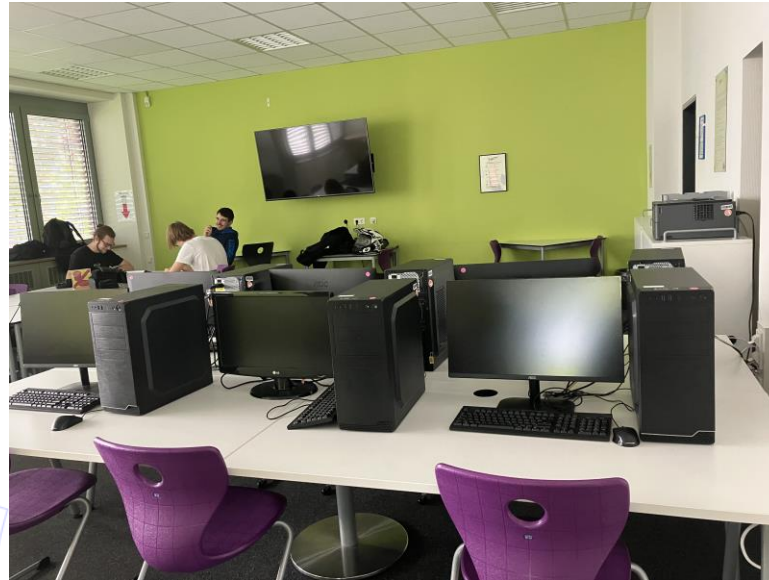
Students studie center